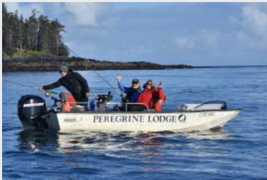
23' Edgewater Upgrade