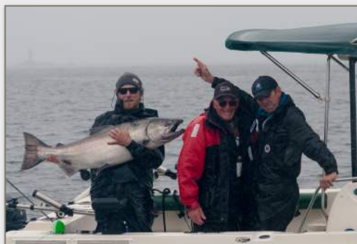
Caught June 22-26, 2016