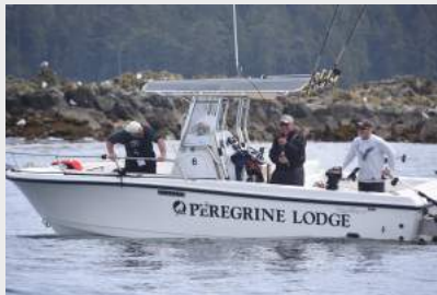
24' Trophy Upgrade